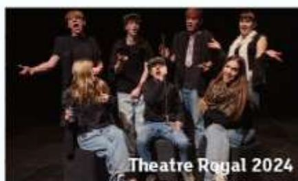
Theatre Royal 2024