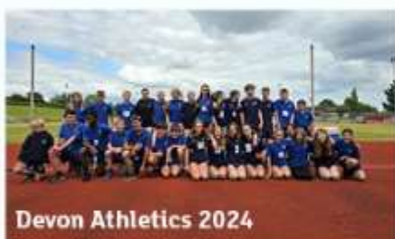
Devon Athletics 2024

Thursday 3rd July & Friday 11th July 2025 9.00am to 11.00am