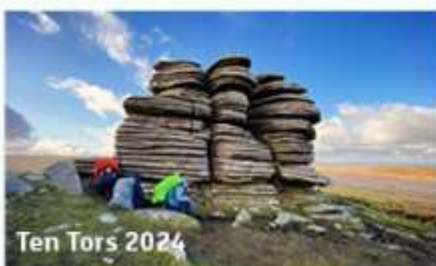
Ten Tors 2024