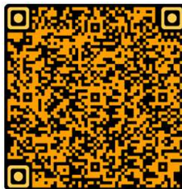
Eventbrite QR Code