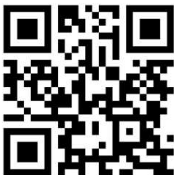
Google Form QR Code

EventBrite Link - https://www.eventbrite.co.uk/e/910636316737?aff=oddtcreator