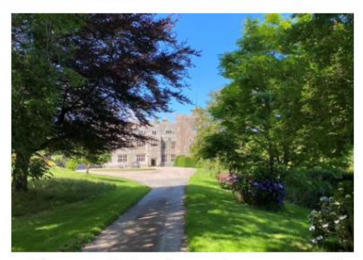
Over 10 acres of stunning gardens surrounding the Grade I listed house Cream teas, cakes, plant stall, raffle etc. Proceeds to charity £5 entry Adults, children free, dogs on leads welcome

Sunday 1 May 2022 2 - 5 pm, West Alvington TQ7 3LL